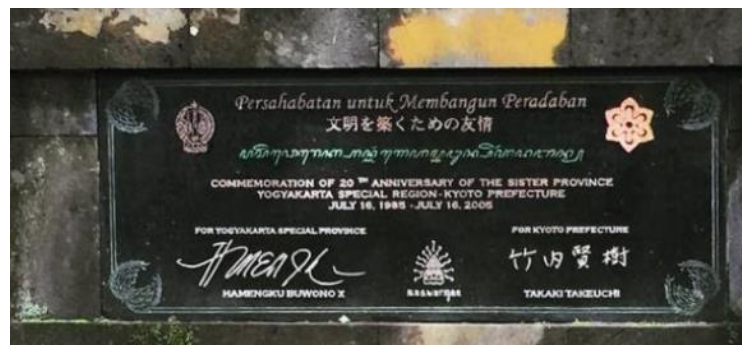
Figure 2. Memento of the 20th Sister Cities

One example of the eco-tourism often visited is the Ullen Sentalu Museum. It is a private museum managed directly by the royal family. A notable point of this museum is that to attract Japanese tourists, they use Japanese brochures, and every description of the displays is translated into the Japanese language. When entering the museum, a reminder of cooperation inscriptions building the friendships can be seen in a civilization commemoration of the 20 th Anniversary of the sister cities (Yogyakarta Province - Kyoto Prefecture) signed by Sri Sultan Hamengku Buwono X and Takaki Takeuchi.