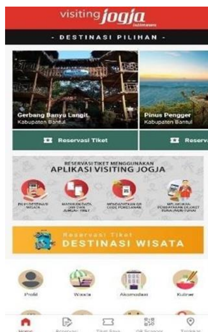
Figure 4. Visiting Jogja Application

The visitingjogja.id website is one of the examples of the use of owned promotion by the Yogyakarta Government. Besides the website, the government has Instagram and Facebook of Visiting Jogja. The government has also launched a mobile application named Visiting Jogja, which can be downloaded from Google Play and the Apple App Store.