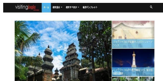
Figure 3. Official Website Tourism Information

Another prominent exhibition is Te Collabo, meaning Technology Collaboration, where there is a merger of Yogyakarta and Kyoto craftsmen’s artworks in the development of modifications of Yogyakarta batik fabrics and Kyoto silk. This exhibition has been performed in both Yogyakarta and Kyoto. Yogyakarta lessons are provided in tourism promotion and information to gain attention from international tourists to overcome the language barriers. A language is a tool for communication. Sometimes, language becomes a barrier, but in today’s times, it is an insignificant obstacle due to the availability of travel apps on mobile devices. For tourism information, Yogyakarta has an accessible website, visitingjogja.id , established in 2005. This website has many tourist destinations in Yogyakarta with brief information about the attractions delivered in four languages: Indonesian, English, Korean and Japanese. The features include contact persons and details for visitor centers. As per the discussion, using Japanese language features on the official website of tourist information in Yogyakarta can make it easier for Kyoto tourists to get information about respective tourist attractions and visit Indonesia. Below is the home view of the visitingjogja.id website in the Japanese language.